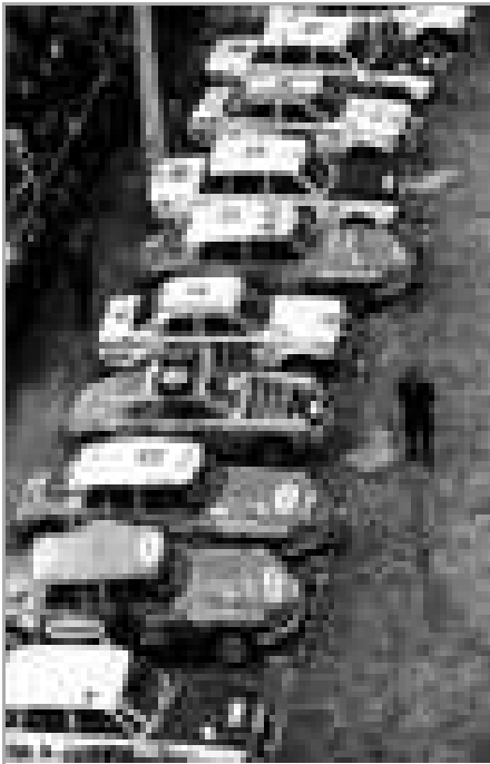
SANTIAGO, Chile, the 43 surviving crews at rest 13 th May, after their grueling 3,800-mile nonstop drive from Rio de Janeiro.