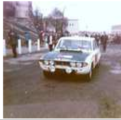
Paddy Hopkirk on the way to the Wembley start in his works Triumph 2.5 PI