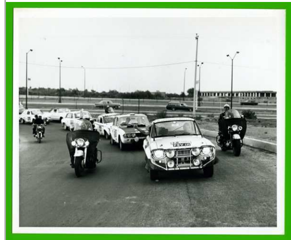
Headed by the winning Mikkola/Palm Ford Escort, the finishers are escorted to the Aztec Stadium at the end of the rally.

Overall winner of the rally was Hannu Mikkola & Gunnar Palm, driving a Ford Escort 1850GT, one hour and eighteen minutes ahead of Culcheth & Syer's Triumph 2.5PI who in turn were 21 minutes ahead of Aaltonen & Liddon's Ford Escort 1850GT. True to form, the Blue Oval's marketing department used their success on the event to good effect for some time to come and it spawned a whole new model line in the UK with the birth of the Escort Mexico and all that went with it.