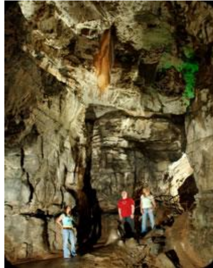
Exploring the caves.

From here the route took us to Llanwrtyd Wells via Brecon. Once again there was snow on the higher ground as we climbed towards the Crai reservoir and on towards Eppynt. Despite it being Easter weekend, the weather seemed to keep a lot of cars off the road, which made the journey more fun for those of us on the road without the normal bank holiday crush to deal with.