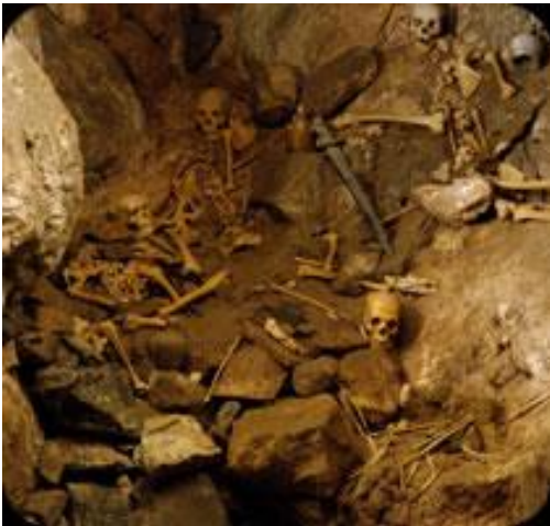
The Bone cave.

Unfortunately, whilst we were enjoying our break, it decided to rain rather heavily. This lost us some of the open cars, a great pity.