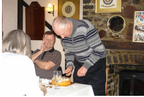
You can't keep birthday's quiet with us!

A good day out, nice route and good company with five or six crews new to us. Perhaps they might feel like joining in with us all again.