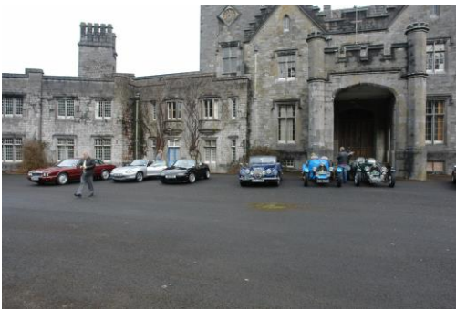
The Mansion in all its splendour.

The road run start point was the carpark of the estate, although the rangers opened the mansion grounds for the entrants to see the property and to enable them to take photographs of the cars in front of the mansion.