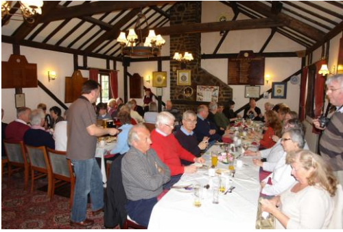
A full house at the White Hart