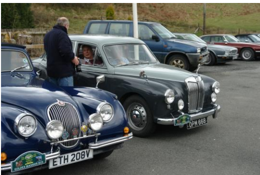
An MG ZB, and a ZA came along, and a hardy couple in a D-type with no heater!!

Once through Beulah, we headed for the Cambrian Woollen Mill and stopover number two for those who wanted another coffee or to let the wives and girlfriends look around the shop.