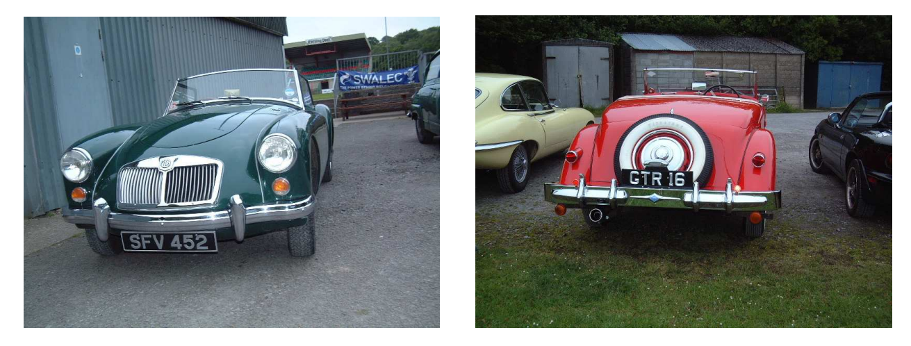
Very nice MGA and Riley (flanked by E type and MX5)

Our Car Show on 1<sup>st</sup> June attracted around a dozen cars despite slightly inclement weather. Modern(ish) sports cars were well represented by MG TF, Honda CRX, Mazda MX5 and TVR whilst slightly older sports cars included E type Jag and MGA. We also had Mini, Singer, Riley, Volvo and Saab plus Jag XK150 style Aristocat. Thanks to all who brought their vehicles along.